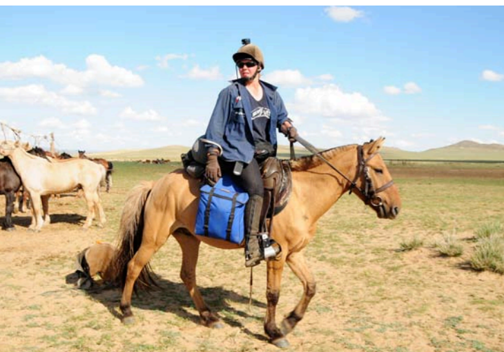
Top to Bottom:

“Making glass beads is a freedom in itself because you can create something specifically to match the gem stones.”